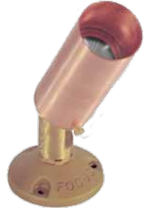
RXD-02-TS-COP shown on FA-24-BRS